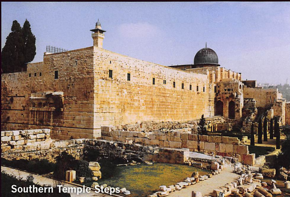
Southern Temple Steps

Scheduled International Flights • Top Quality Four Star Hotels • Israeli Buffet Breakfast & Dinner Daily • Top Guide with In-Depth Knowledge of the Old and New Testaments • Private Air Conditioned Motorcoach Visits to the Major Historical Sites • Boat Ride on the Sea of Galilee • Certificate of Your Pilgrimage to ISRAEL .....and more!