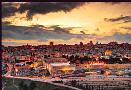
Sunset over Jerusalem