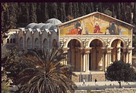
Church of all Nations

SPECIAL NOTE: In our Israel tour, you will see a lot of people in the streets of the Old City and many other interesting sites.